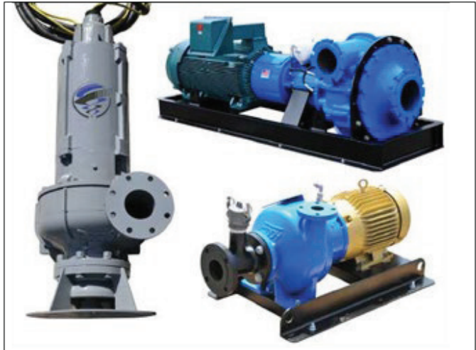
*Typical Deployment Photo. Dredge pumps can be deployed vertically or horizontally. Photos for general guidance. Contact us for further details.